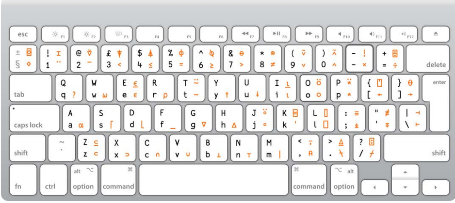
Figure 7. The default Session keyboard key mappings (UK keyboard)

The keyboard key mappings shown in figure 7 are the default mappings that are enabled when a Dyalog Session is started with a UK locale.